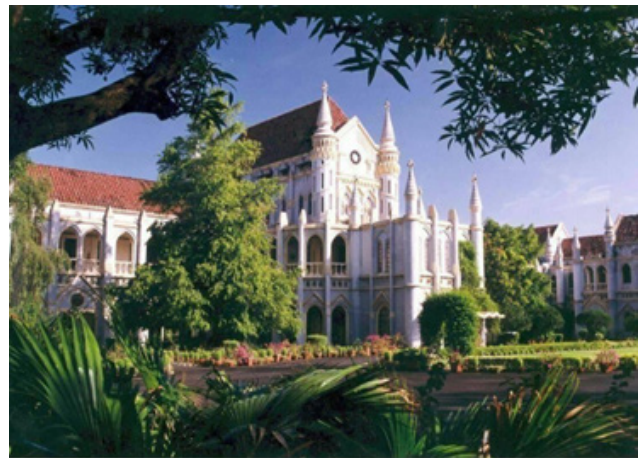
Madhya Pradesh High Court