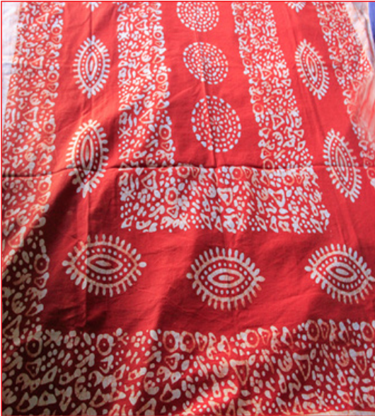
Batik print of Ujjain