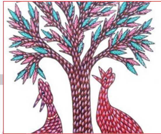
Gond painting of Dindori