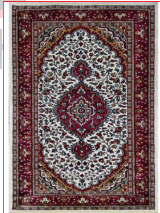
Carpet of Gwalior