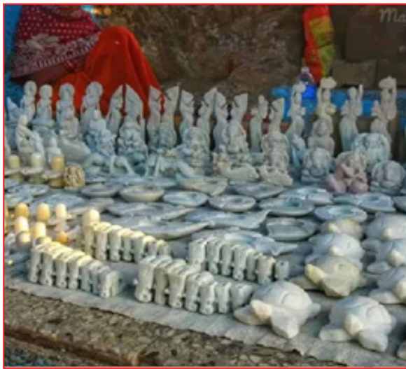
Stone craft of Jabalpur Bhedaghat